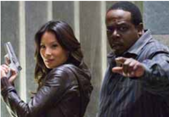
c) Cedric the Entertainer (& Lucy Liu)