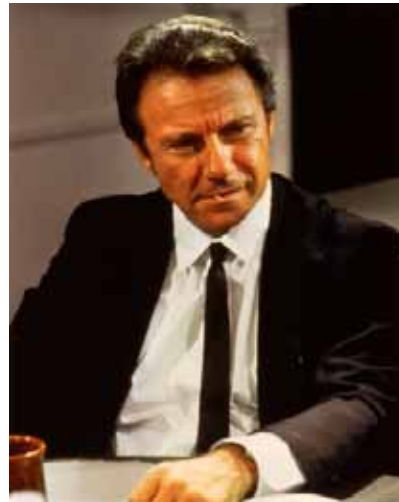
d) Harvey Keitel