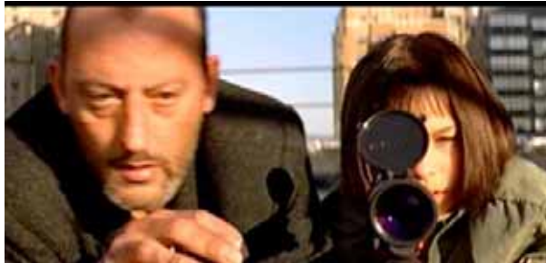
b) Jean Reno (& Natalie Portman)